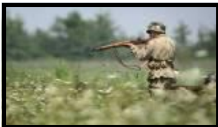
Top: Mark Giroux in a WWI style trench