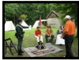
Above: Re-enactors taking a break. Below: Re-enactors at the table in their encampment.