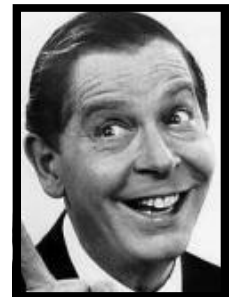
Above: A few of the greats.