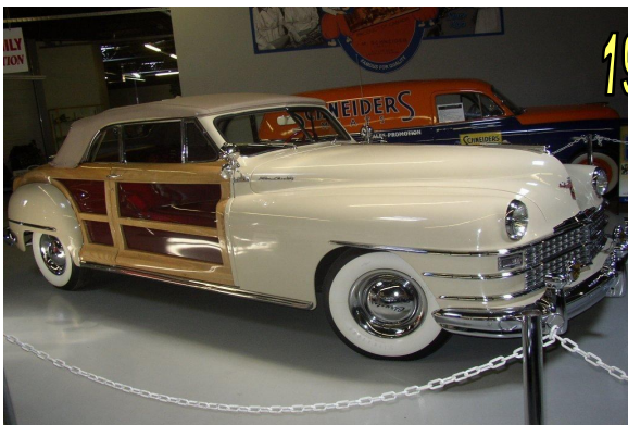
1946 Chrysler Town & Country Convertible