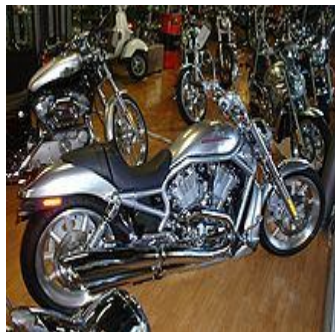
V-Rod on the show room