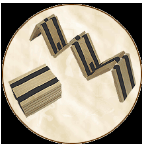
Jacob 's ladder