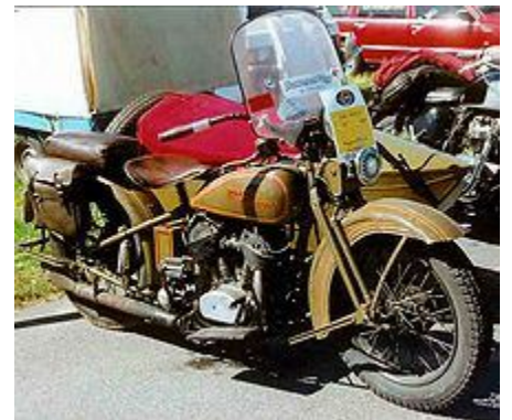
Harley-Davidson 1200 cc SV 1931