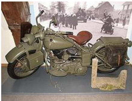
Harley produced the WLC for the Canadian military.

Throughout the years, police and military organizations have realized the advantages of using Harley-Davidson motorcycles. Today, benefits such as high resale value and the ability of the motorcycle to enhance public relations (critical to community policing efforts) continue to increase our police/fleet business. "There is something undeniably right about a cop on a Harley-Davidson."