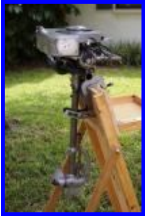
Pictured above: A rare 1922 Johnson outboard motor, one of only 1,000 made.