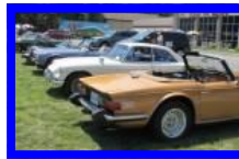
Above and left: Photos from our recent British Car Show