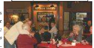
Below: Spreading Christmas Cheer